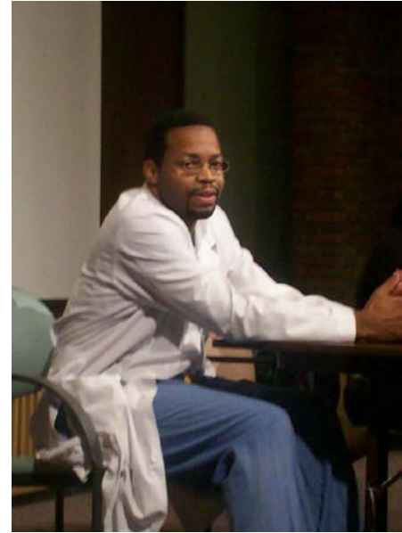
Residents from Wishard Hospital share candidly about the rigors of medical school, expectations and their professional journeys.

The Rawls Scholars Medicine Initiative had an astounding impact on its participants. They were able to interact with not just the top male and female surgeons, but also with CLD alumni who had completed medical school and who were completing their residency programs. This exposure gave them the opportunity to visualize other African Americans who had indeed completed medical school; thereby, making the impossible appear to be much more possible. The participants received first-hand knowledge of the academic rigors and the possible social distractions. Moreover, the participants had the opportunity to speak with an admissions counselor and find out the requirements for entering medical school. Participants left the program with a heightened level of confidence and a realization that medical school admissions and graduation is indeed achievable.