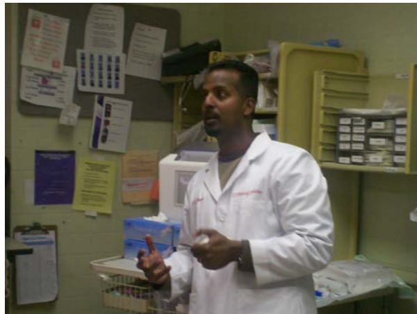
The Rawls Scholars participants had the opportunity to visit the trauma unit at Wishard Hospital and speak with emergency room physicians.