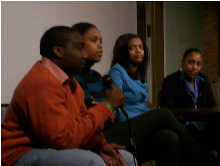
Current Indiana University School of Medicine medical students and Rawls Scholars scholarship recipients speak to the CLD participants about their academic and personal experiences and what it takes to be successful.